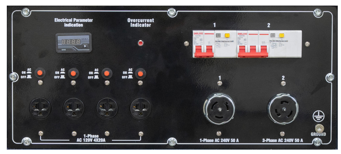
4x single phase AC 120V 4x20A sockets, single phase AC 240V 50A socket, and 3-phase AC 240V 50A socket.