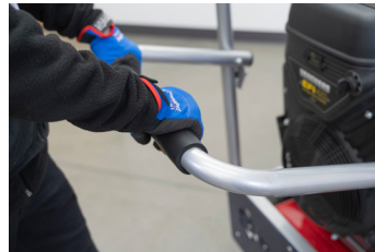
EASY PULL HANDLE