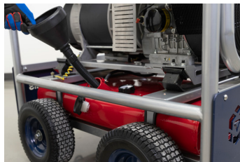
EASY FILL 13 GALLON GAS TANK