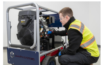
EASY MAINTENANCE ACCESS