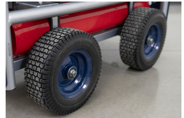
AIRLESS RUNFLAT TIRES