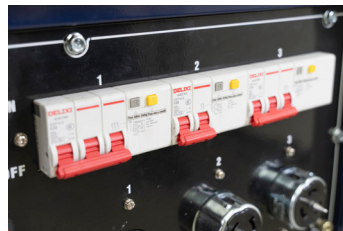
BREAKERS FOR CIRCUIT PROTECTION