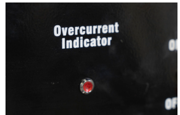
OVER CURRENT PROTECTION