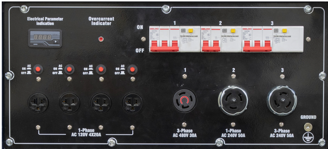
4x single phase AC 120V 4x20A sockets, 480V 3-phase socket, single phase AC 240V 50A socket, and 3-phase AC 240V 50A socket.