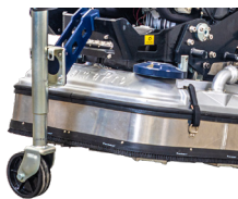
Third wheel for easy job site movement