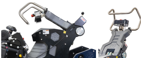
Large foldable handle for easy operation and compact storage