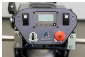
Centralized control unit with carbon monoxide monitor