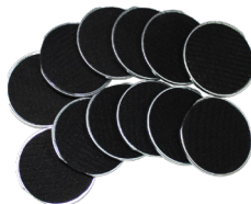
12 Velcro Holders