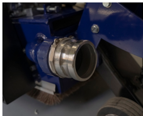
DUST CONTROL PORT