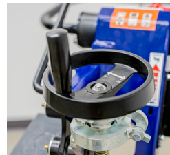
FINE ADJUSTMENT HANDLE WHEEL