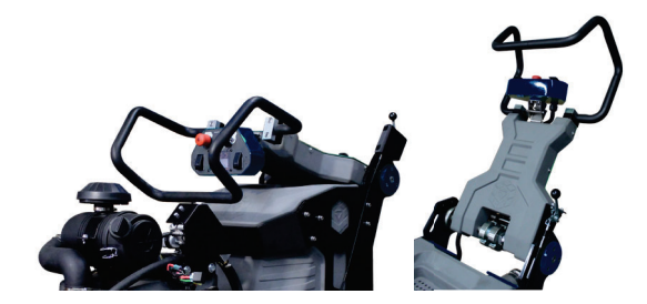
Large foldable handle for easy operation and compact storage